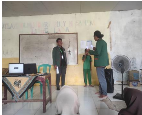
Gambar 3. Kuis edukatif (siswa yang menjawab pertanyaan diberi hadiah)