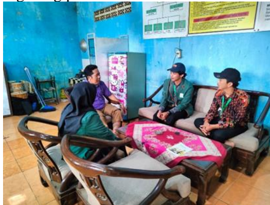
Figure 2. The visit of the Unusia Community Service team to Al-Zira IT Junior High School, regarding permission to carry out healthy internet socialisation.

the aim of asking permission to hold a healthy internet socialisation at the school. After getting permission.