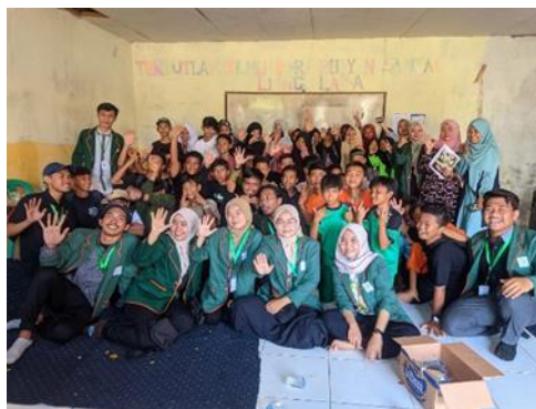
Picture 4. Documentation after the completion of the healthy internet socialisation (at Al-Zira IT Junior High School)