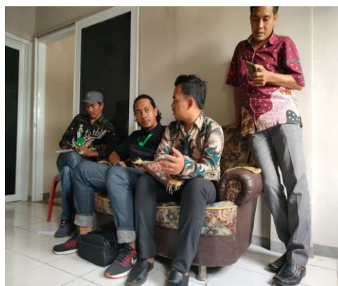
Figure 1: Interview between the Unusia community service team and Candali Village.